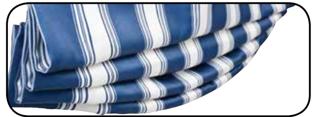
Valance measurements start from the top of the headrail to the center of the smile